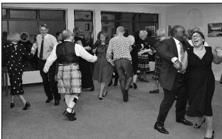
BURNS NIGHT: Members of St Mary's congregation celebrated in style in January.