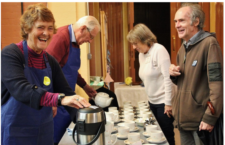
PICTURED: Some of the friendly team of 'baristas' ready to welcome you!